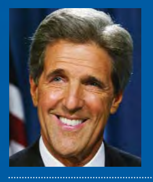
Senator John Kerry U.S. Senate (D-MA) Toothbrush color: Blue Toothbrush type: Manual