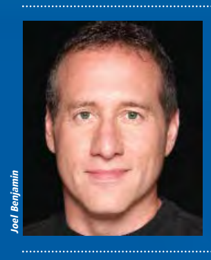
Joseph Finder Author, High Crimes, Paranoia, and Company Man Toothbrush colors/types: White electric and purple manual