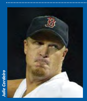
Mike Timlin Pitcher, Boston Red Sox Toothbrush color: Usually purple, blue, or green Toothbrush type: Manual