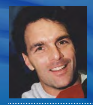
Doug Flutie Quarterback, New England Patriots, and 1984 Heisman Trophy Winner Toothbrush color: Blue Toothbrush type: Manual