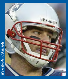
Tom Brady Quarterback, New England Patriots Toothbrush color: Blue Toothbrush type: Manual