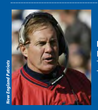
Bill Belichick Head Coach, New England Patriots Toothbrush color: Blue Toothbrush type: Manual