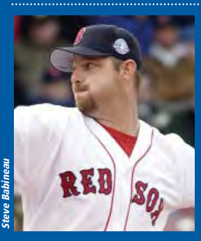
Alan Embree Pitcher, Boston Red Sox Toothbrush color: Black bristles Toothbrush type: Manual