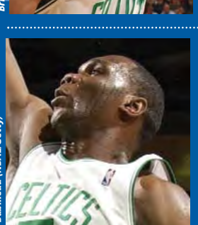
Al Jefferson Forward, Boston Celtics Toothbrush color: Blue Toothbrush type: Manual