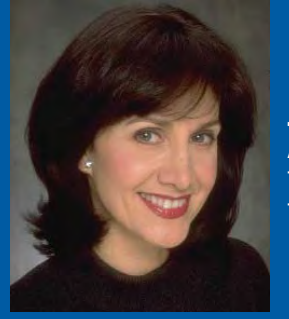
Joyce Kulhawik Arts and Entertainment Anchor, CBS4 Toothbrush color: Purple Toothbrush type: Manual

Special thanks to the Massachusetts Film Bureau for providing contact information.