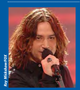
Constantine Maroulis American Idol Finalist, Vocalist, and Graduate of the Boston Conservatory Toothbrush color: Red & white Toothbrush type: Manual