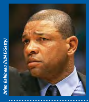
Doc Rivers Head Coach, Boston Celtics Toothbrush color: White Toothbrush type: Electric