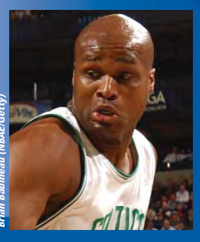
Antoine Walker Forward, Boston Celtics Toothbrush color: Blue Toothbrush type: Both electric & manual