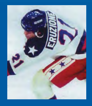
Mike Eruzione Captain, 1980 U.S. Olympic Hockey Team Toothbrush color: Blue Toothbrush type: Manual