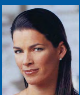
Nancy Kerrigan U.S. Olympic Figure Skating Medalist Toothbrush color: White Toothbrush type: Electric