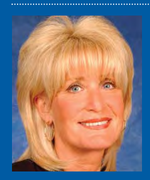
Susan Wornick Anchor/Consumer Reporter, WCVB-TV Channel 5 Toothbrush color: Pastel Toothbrush type: Manual