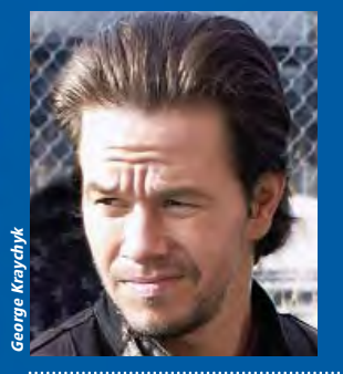
Mark Wahlberg Actor Toothbrush color: Multicolored Toothbrush type: Manual

So if you've ever wondered what type of toothbrush your favorite Boston-area celebrity (and a few you maybe didn't know had ties to the Bay State) uses, read on. And the next time you brush your teeth, you may find yourself thinking about which other celebs use the same color toothbrush you do.