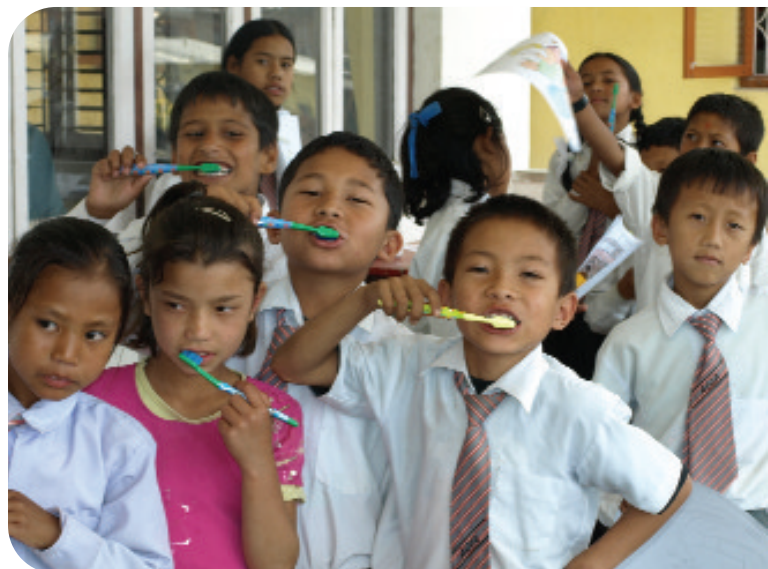
Children at the Shree Mangal Dvip Boarding School in Kathmandu show off their brushing skills as they wait to be treated by volunteers from the Himalayan Dental Relief Project.

A classroom at the school was used as the dental clinic, which included three fully functional mobile dental units. Dr. Paglia saw approximately 25 to 30 patients per day, mostly children. Some of