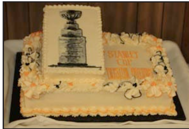
Dessert anyone? And now for dessert...