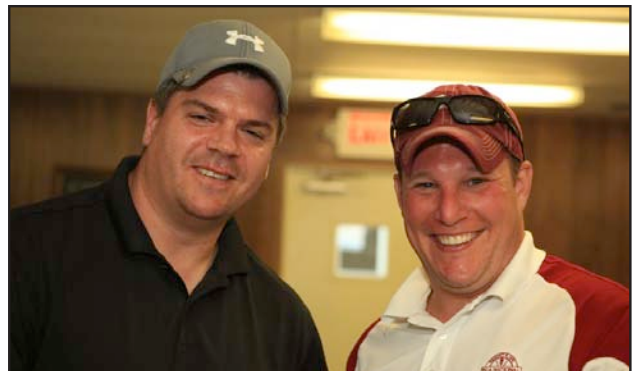
My implant is better than your implant???