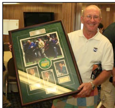
Is this tournament rigged?